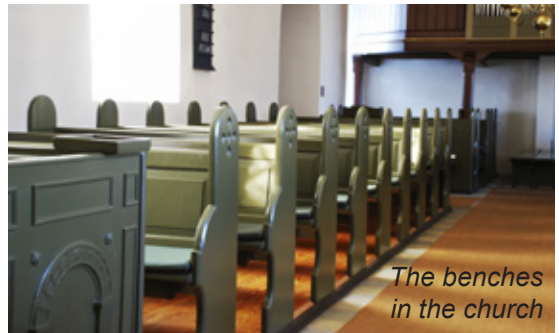
The benches in the church