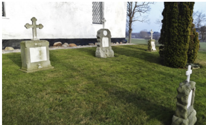
Part of the churchyard for burial of urns